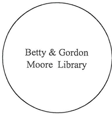
Betty & Gordon Moore Library